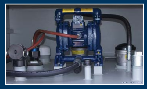
The SafeWaste mechanical components are enclosed in an easily accessible compartment.