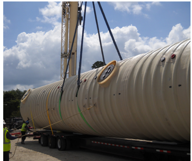
This tank will be mechanically unloaded using slings. Slings are separated using a spreader bar according to the minimum spacing requirements. Wider sling spacing may be necessary to balance the tank.