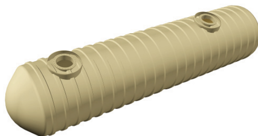
Upon completion manways and collars are added to each compartment.