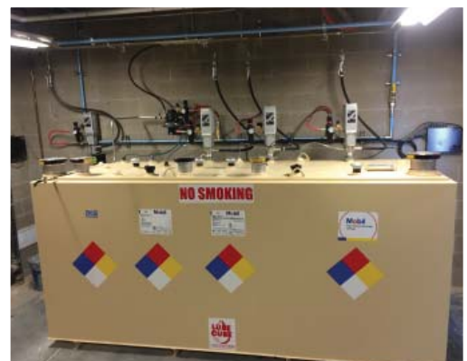
1,250 gallon, 4 compartment tank.

* Savings will vary by area, and are dependant on insurance carrier.