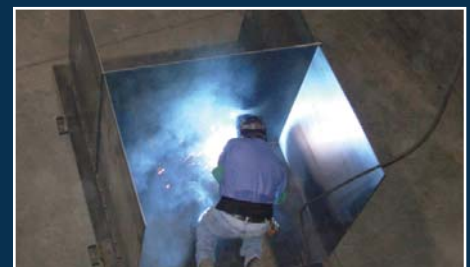
The Bench Top can be designed with custom compartments for multi-purpose use.